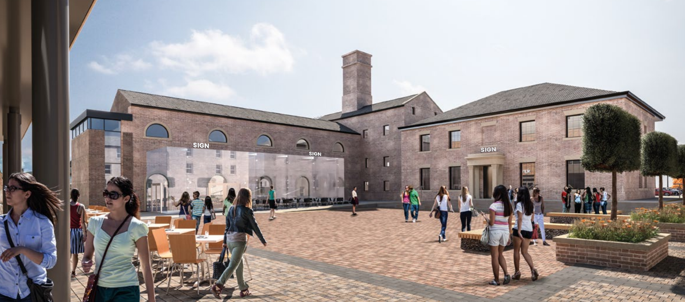
Block D (left) and Block B Former Governors House (right)