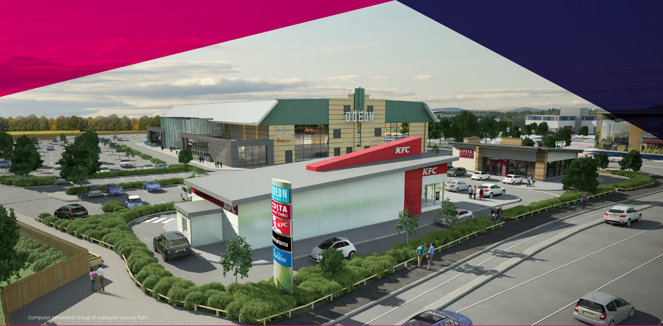
Computer generated image of Gallagher Leisure Park